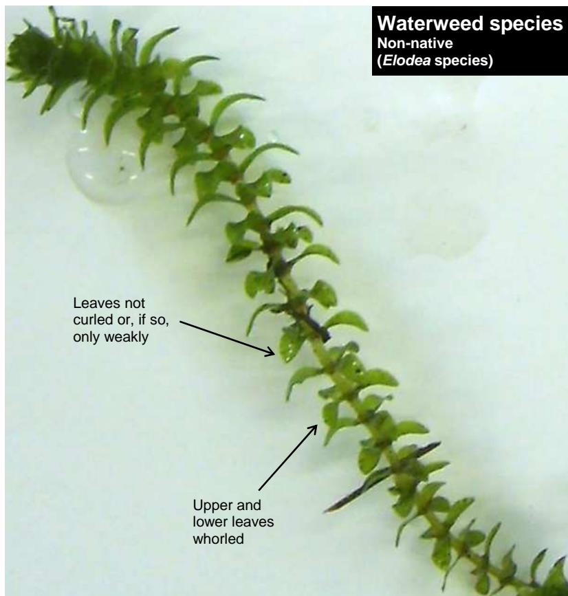
Waterweed species Non-native ( Elodea species)

Leaves not curled or, if so, only weakly